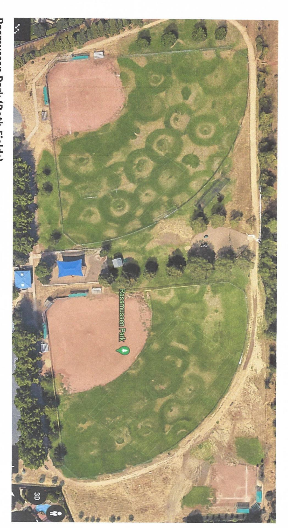
Rasmussen Park (Both Fields) 3610 Mira Loma Dr, Cameron Park, CA 95682