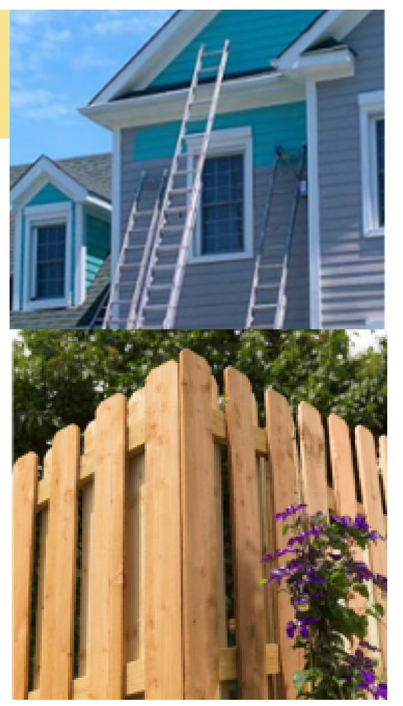
A copy of your CC&Rs and a map identifying your neighborhood is available online at <u>www.cameronpark.org</u>.