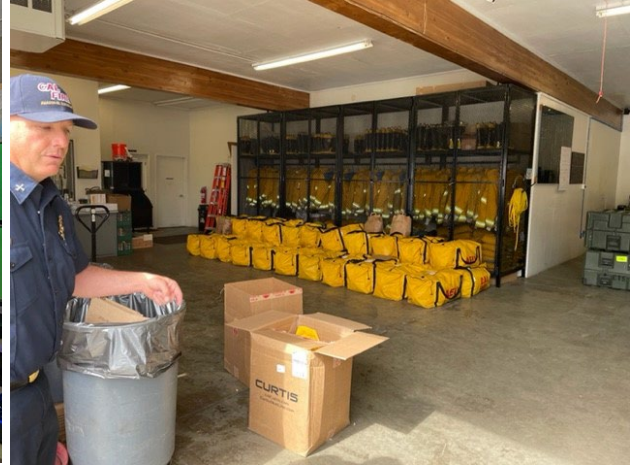
Tours of the communications and PPE inventory facilities.