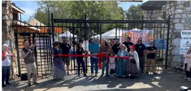
A full house at the Tri-County Chamber mixer at Marshal Medical Center; ribbon cutting at EDC Fairgrounds.