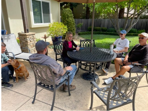
The Pickle Ball Sound Mitigation Task Force meets in the backyard of a neighbor.