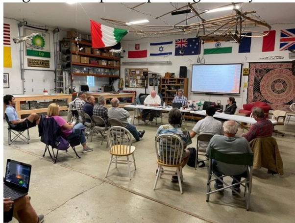
Cameron Park Airport District BOD meeting in the private hanger of an Airpark resident.

Staff continue to plan the Summer Spectacular, to be held on Saturday, June 25 th . Plans continue to develop and we are making progress towards completing several tasks needed to host a great event this summer. One of those tasks was meeting with the Board of Directors for the Cameron Park Airport District. The Board approved the use of Baron Court and Boeing Road for public parking the day of our event.