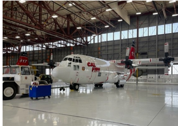
Tour of base operations at McClellan Airpark.