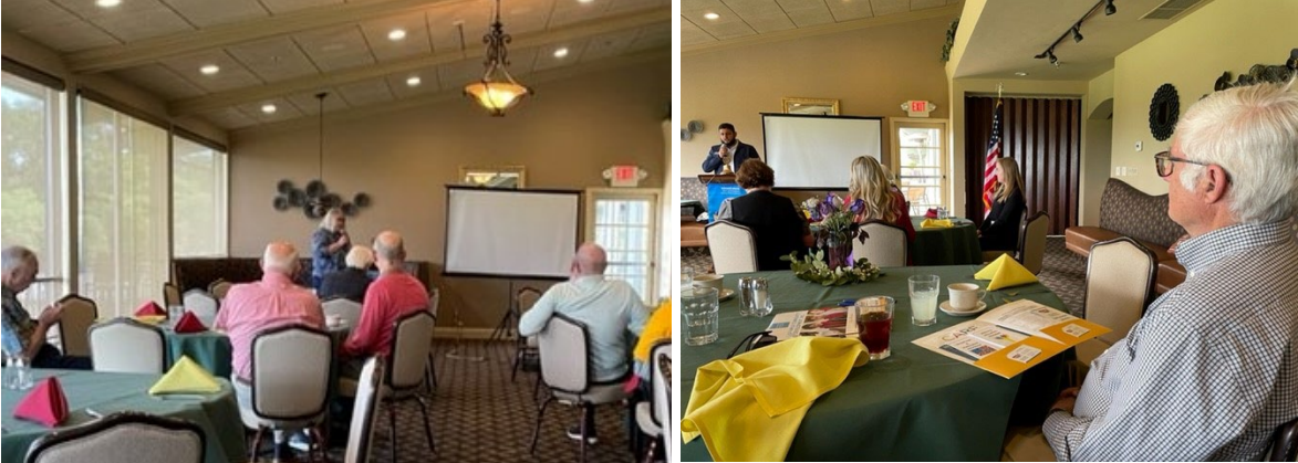
Lunches for CP Rotary Club take place at Cameron Park Country Club and feature guest speakers each week.