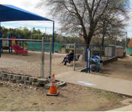
ENTRY/ PLAY AREA