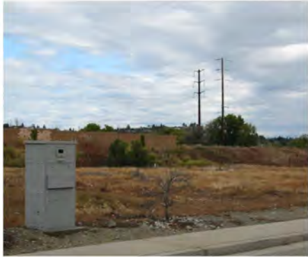
EASTERN OPEN SPACE AREA