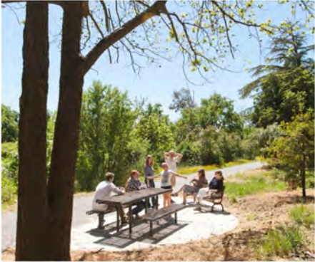
SMALL PICNIC AREA