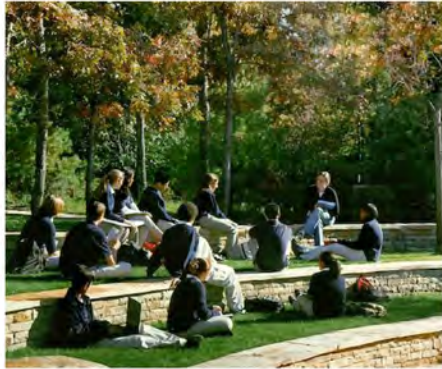
OUTDOOR CLASSROOM/ AMPHITHEATER