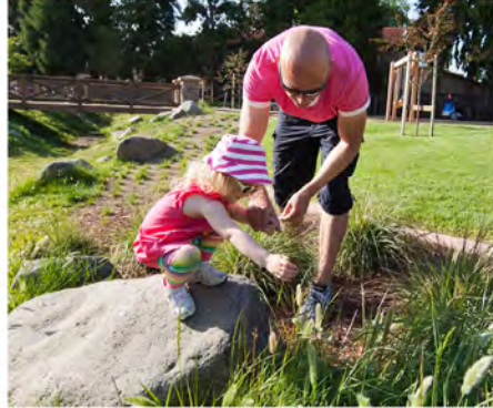
SWALE/ NATURE AREA