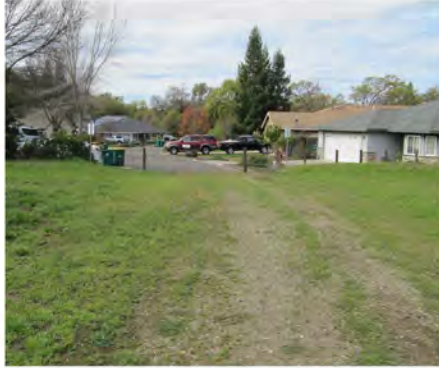
SECONDARY ACCESS FROM MONUKKA DR