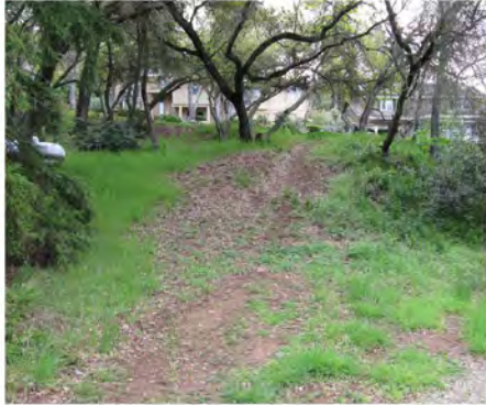
SECONDARY ACCESS POINT FROM ROYAL DR