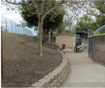
SLOPE BETWEEN BASEBALL FIELD & WESTERN OPEN SPACE AREA