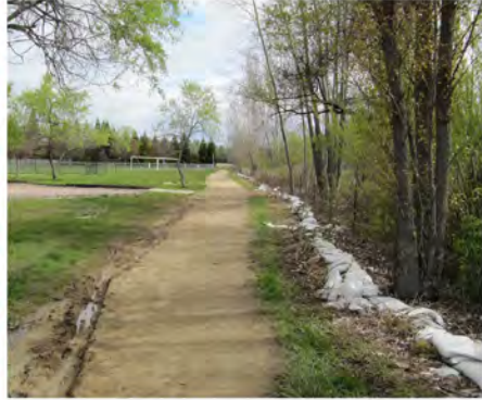
TRAIL WITH TEMPORARY FLOOD PROTECTION