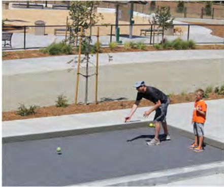
BOCCE BALL COURT