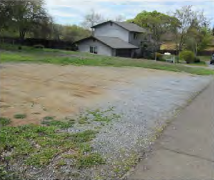
FLAT AREA ALONG NORTHERN EDGE