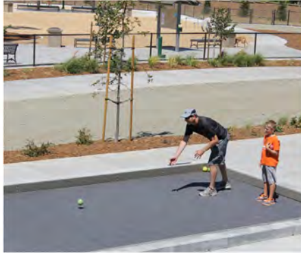
BOCCE BALL COURT