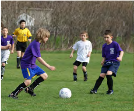
YOUTH SOCCER FIELD