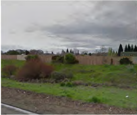
WALL ALONG EASTERN OPEN SPACE AREA