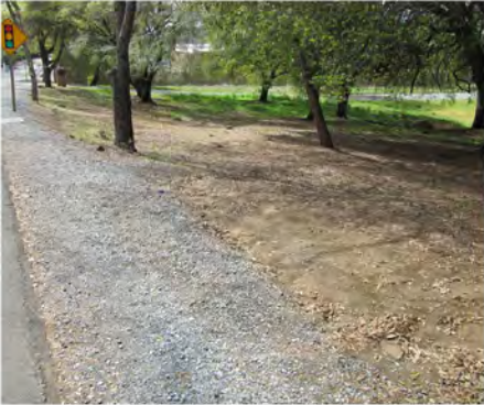
GRAVEL SHOULDER ALONG PERIMETER