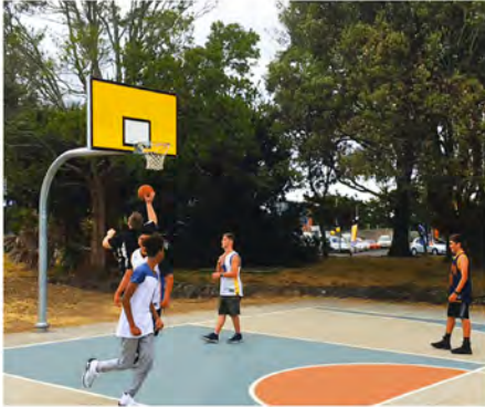
HALF SIZE BASKETBALL COURT