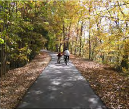
ADA ACCESSIBLE TRAIL