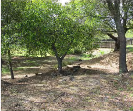
EXISTING SLOPE AND TREES