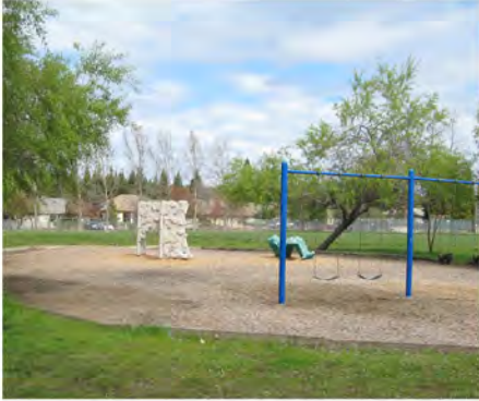
SECONDARY PLAY AREA