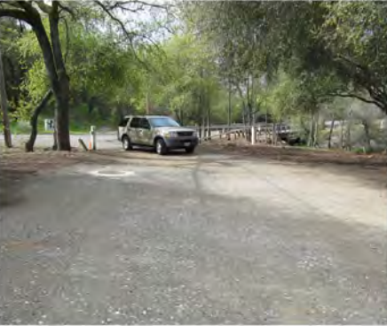
GRAVEL PARKING LOT