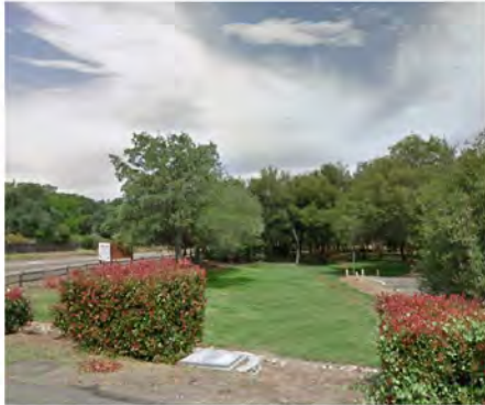
LAWN AREA ADJACENT TO PARKING LOT