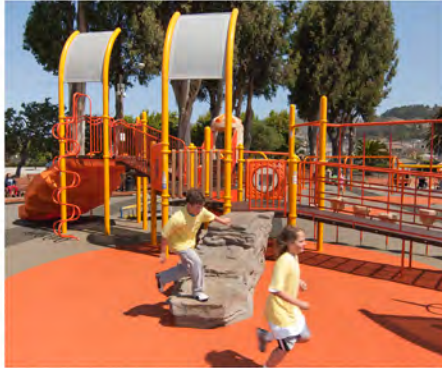
TRADITIONAL PLAY AREA