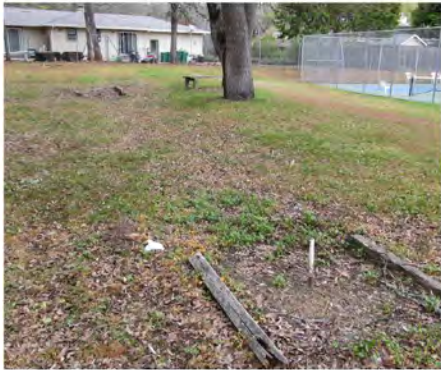
HORSE SHOE PITS